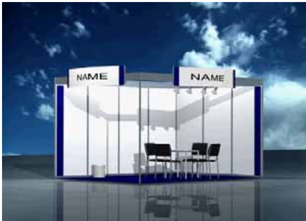
STAND SYSTEM „GOLF STANDARD“ Standard stands – additional equipment (p.t.o.) at extra charge.