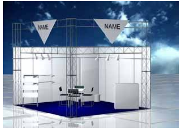
STAND SYSTEM „GOLF ATRIUM“

Hereby we order the stand system GOLF STANDARD with the following basic equipment at the price of EUR 68,00 per sq.m + statutory V.A.T.