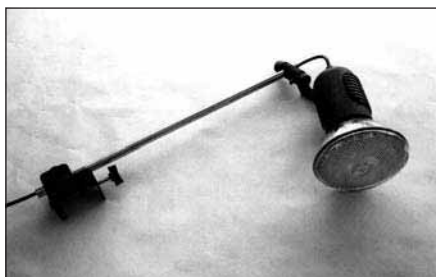
32801 Clamp-on spotlight with extending arm 100 W bulb