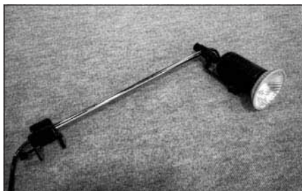
32821 Clamp-on spotlight with extension arm Halogen spot, 100 W