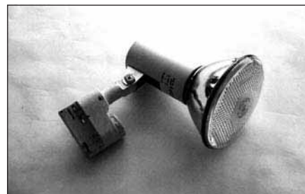
32823 Spotlight for lighting rail 75 W, adjustable

Messe München GmbH's accredited service partners can offer you good value electrical installations incl. lighting for your exhibition stand tailor-made to suit your specific requirements.