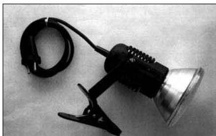
32800 Clamp-on spotlight 100 W bulb